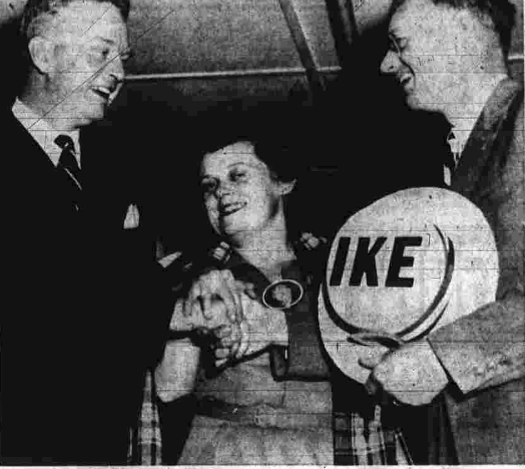
Senators and House members in the Capitol building today were greeted by a cheering throng of supporters.